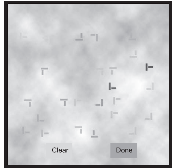
Fig. 1. Sample search display used in the experiment. Stimuli consisted of pairs of rectangles, with the members of each pair oriented perpendicularly to each other to form perfect T shapes (targets) or non-T shapes (distractors). Each trial contained no, one, or two targets among 23 to 25 distractors (a display with two targets and 23 distractors is shown here). Targets were made more or less salient by increasing or decreasing their black level. Stimuli were presented on a background of gray-scale “clouds.” The color of the border around the display, shown here in black, changed between blue and green to signal the block condition (threat of shock or no threat, respectively). Participants clicked “Done” when they completed their search for targets, or “Clear” to reset their clicks.

Stimuli were pairs of rectangles with a width of 0.3^\circ of visual angle; each pair was contained within the bounds of an invisible 1.3^\circ \times 1.3^\circ square (Fig. 1). The members of each pair were oriented perpendicularly to each other and slightly separated. Targets were perfect T shapes and appeared in one of two salience levels (high salience: 57%–65% black; low salience: 22%–45% black). Distractors were non-T shapes ranging from